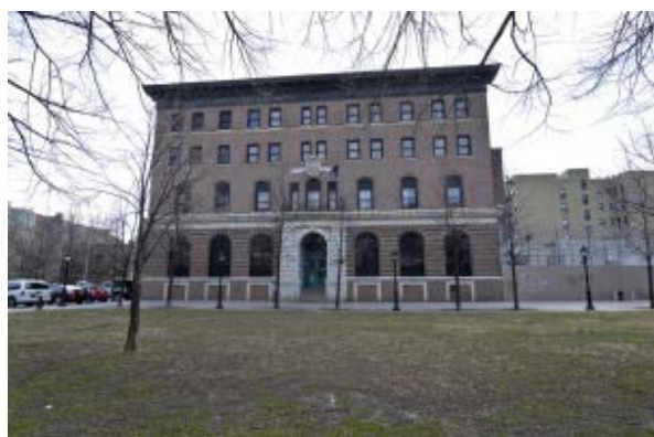
470 East 161st Street.

Pyramid Investors JV LLC , a joint venture between Manhattan-based Bluestone Group and Bronx developers Altmark Group , closed on the $6.65 million purchase of the Pyramid Reception Center in the Bronx last Thursday, Commercial Observer has learned.