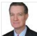
Robert Sammons The "New" Grand Central District?